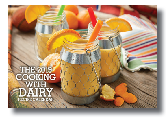
Above: The cover of the 2019 Cooking With Dairy Calendar.

Southwest and Southland Dairy Farmers have been busy prepping, preparing, taking pictures and shooting videos for the upcoming 2019 Cooking with Dairy Calendars and our dairy recipe video clips. Once again, our free popular "Cooking With Dairy" calendars have been inspired by our own staff at Southwest and Southland Dairy Farmers. Each month features a recipe provided by a member of our SWDF/SLDF family using a variety of dairy ingredients. Be on the lookout for these new videos at southwestdairyfarmers.com and our Facebook page. The 2019 calendars will be mailed to all supporting dairy producers later this year. Any others, who would like to receive a calendar, please call (903) 439-MILK.