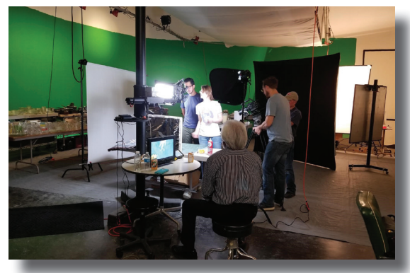
Above: Behind the scenes during the dairy recipe video shoot.